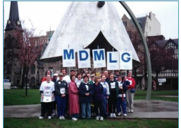
MDMLG at Race for the Cure, 2001